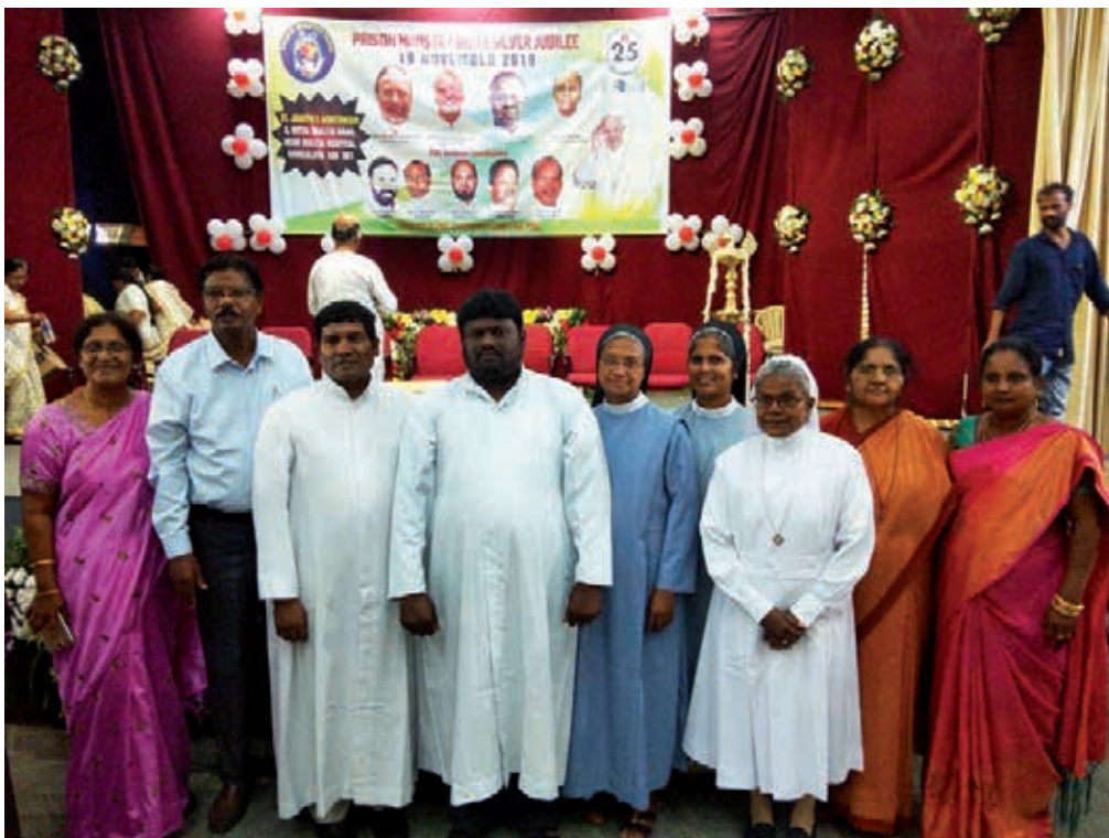
Prison Ministry Volunteers from Andhra Pradesh Region

Prison Ministry is indeed a very fulfilling mission, a special call to live the words of Jesus, “The spirit of the Lord is up on me. He has anointed me to bring Good News to the poor, to proclaim liberty to captives...and sight to the blind. To free the oppressed.....(Lk.4:18..)